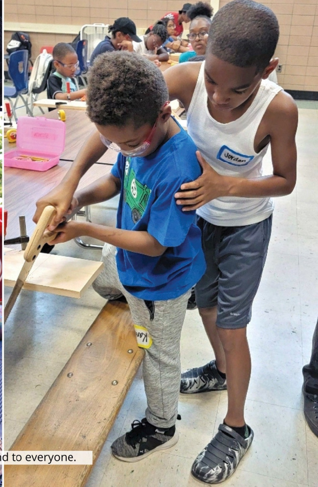
And we are kind to everyone.